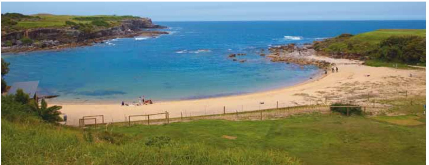
Location shot over Little Bay